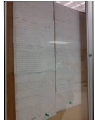
One of the printouts outside of a courtroom

The layout itself of Brooklyn Housing Court is confusing because the floors it occupies are not consecutive. The Landlord/Tenant Clerk's office is on the 2 nd floor, as are the computers and copiers available for tenant use. However, courtrooms for both resolution and trial parts are located on the 4 th , 5 th , 6 th and 9 th floors, skipping the 3 rd , 7 th and 8 th . This can be very confusing for someone who has never been to Housing Court before. Signage in the lobby to indicate which floors offer which services is extremely limited and the area where signs are located is often quite crowded, making the few signs that do exist difficult to see. Thus, a unrepresented tenant arriving at Brooklyn Housing Court for the first time is likely to be immediately confused by a question as simple as where to go.