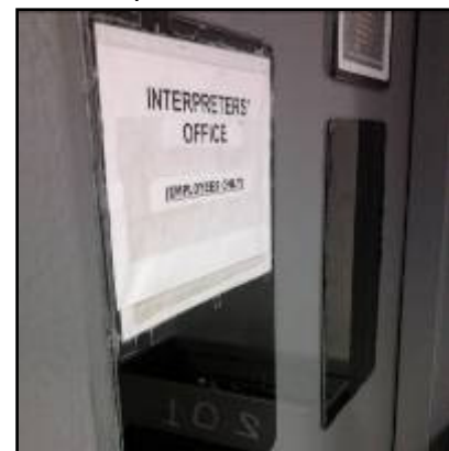
Sign on the door to the interpreters’ office, stating that access is for “employees only”

English) “Interpreters’ Office, Employees Only.” During a recent visit to housing court, when a staff person emerging from the office was asked if an advocate could enter the office to make an inquiry about interpretation services, the staff person replied “What’s the question?” and responded in the hallway rather than inviting the advocate into the office. By all appearances, that office is not accessible to the public.