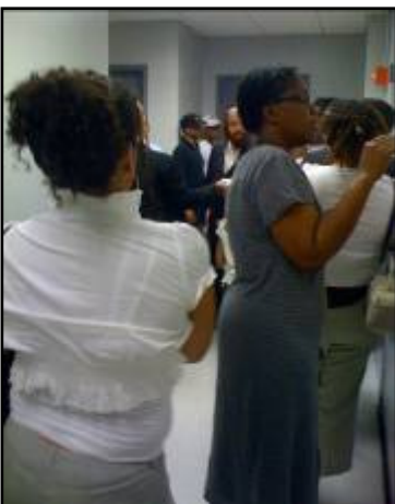
A crowded hallway outside one of the courtrooms at Brooklyn Housing Court

Furthermore, much of the activity at Housing Court takes place outside of the courtrooms – negotiations between parties, lawyers consulting with their clients, tenants discussing their plans with family members, people waiting for their cases. On most days, Brooklyn Housing Court is overcrowded. Its narrow hallways, lack of open spaces and limited seating mean that it is poorly adapted for all this activity.