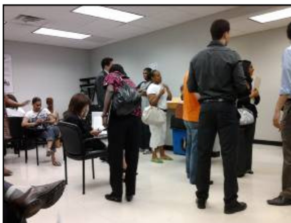
The open space that was formerly Room 508, the “Gutman Mintz Room.”