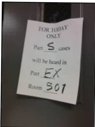
A sign indicating that a lettered part has switched

Once a unrepresented tenant finds the right floor, the next step in this confusing process is to locate the correct courtroom. Cases for each courtroom are listed on computer printouts posted on the walls in narrow hallways near that courtroom. A copy of each printout also hangs on the 2 nd floor near the Clerk's office, indicating in which part each case will be heard. Even after a tenant manages to find these printouts, however, they can be difficult to understand. They are printed in light ink and frequently covered with handwritten notes that were scrawled after printing. After deciphering which lettered part a case is in (Part O or P, for instance), finding that part will not necessarily be easy. While the courtrooms are numbered, the parts are lettered, and the lettered parts frequently switch numbered rooms. It is not uncommon to find a handwritten sign taped to a door saying something like "All Part O cases in room 408 today," meaning that Part O has moved from its usual spot to a different room or even a different floor.