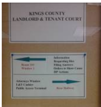
English-only signs directing unrepresented litigants to important services

There is also a notable lack of forms available in languages other than English, meaning that an LEP individual must rely on the help of an interpreter to file answers and fill out other documents. The Help Center’s informational booklets are available in Spanish upon request, but there is no signage to inform Spanish speakers of this.